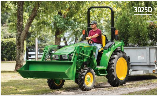
300E LOADER AND DRAWBAR FOR LOADER WORK AND HAULING WAGONS.