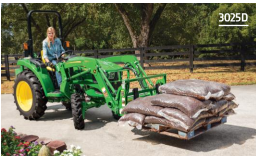
63.6 IN (161.5 CM) TURNING RADIUS. As measured from the inner rear tire with a 300E loader. To maneuver around tight spaces. Add optional pallet forks for even more versatility.