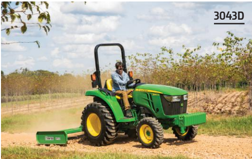
OPTIONAL FRONT WEIGHTS FOR BALLASTING.